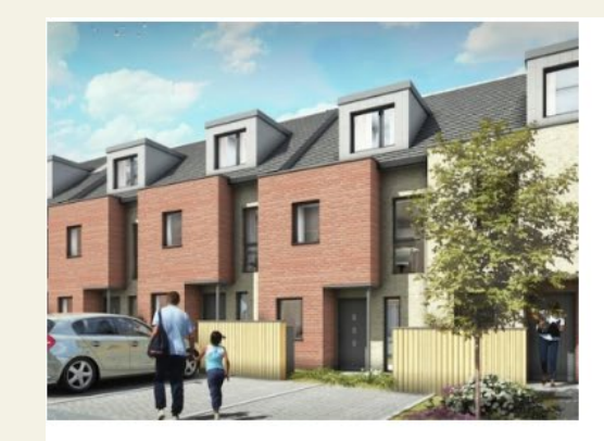
SCHOOL ROAD, HOVE

PMC Construction and Development Services Ltd construction were formed in 1985, delivering projects in all sectors of construction in, Dorset, Hampshire, Wiltshire, Surrey, West and East Sussex. Typical projects range in value from £2,000,000 to £85,000,000. Their focus is building long term relationships with clients, creating repeat business, by collaborative working and providing quality new buildings to budget and programme.