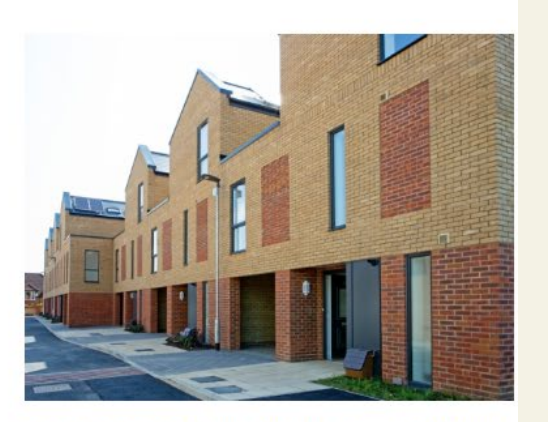
LARGES LANE, EDENFIELD, BRACKNELL