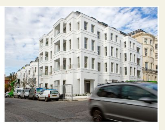
MONTPELIER PLACE, BRIGHTON