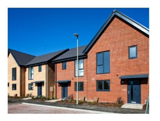
STOCKLAND MEWS, TOTTON