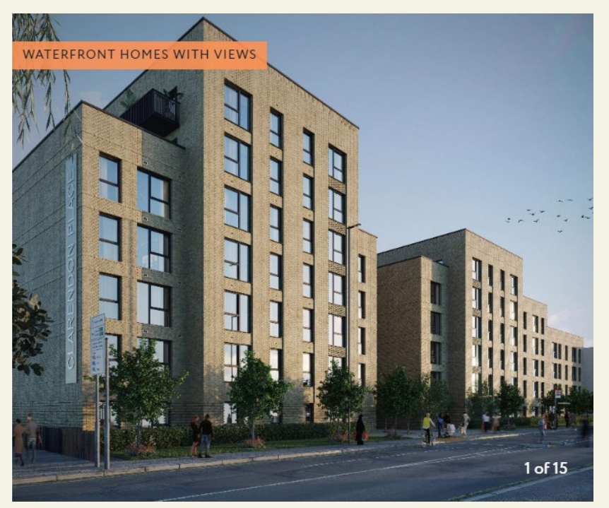
ST James' Square – Portslade JV with BHCC