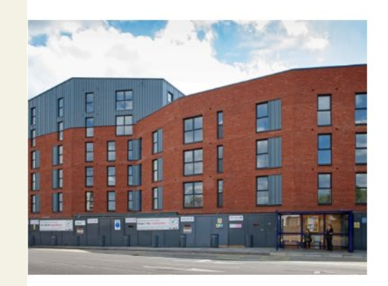
GOLDSMITH AVENUE, PORTSMOUTH