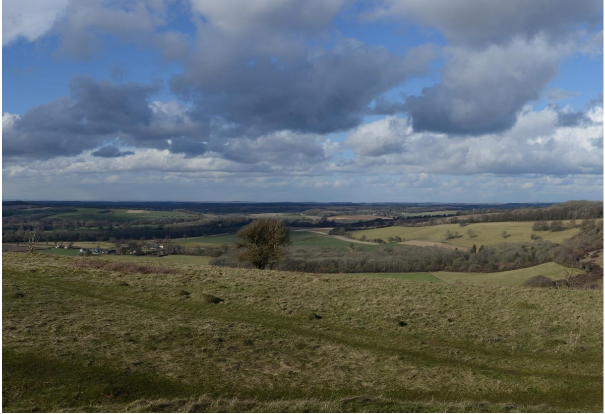
Looking north from Old Winchester Hill (VP5)